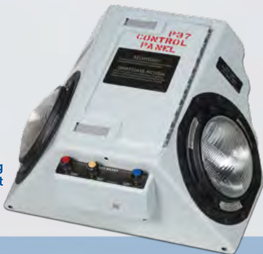
747 landing light

As an experienced fabricator, Castle Industries manufactures racks and operator consoles to enclose sensitive electronic equipment for various military surveillance and communication projects for the defense industry. These units are custom built, and often designed by Castle engineering to the customer's statement of work.