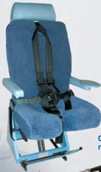
C-17 crew rest seat

Castle is completing its final production contract for the Boeing C-17 crew rest seats. They recently signed a contract for lot 26 which will provide Boeing with seats for the last production aircraft. Post-production, Castle Industries will continue to provide spares and repair services for these seats. Similarly, Castle was a favored manufacturer of attendant and observer seats on the B757 and B767 aircraft and still provides spares to Boeing and other operators as needed.